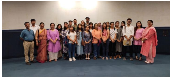
Visit of SHRM students and Faculty to Parliament Museum