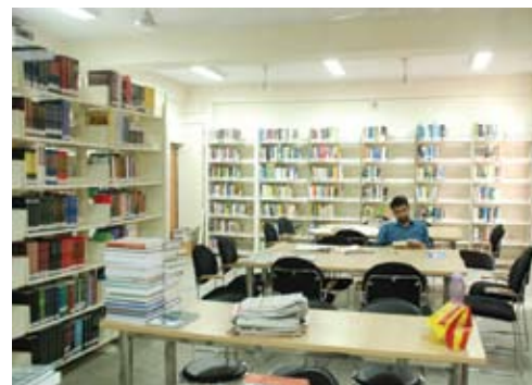
Physical Assets of the University