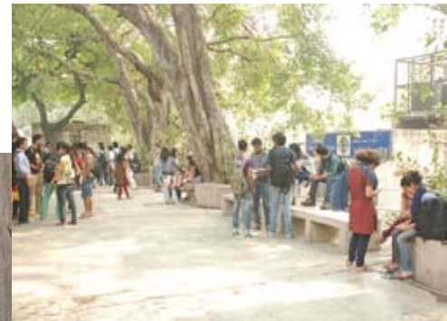
Schools of the University