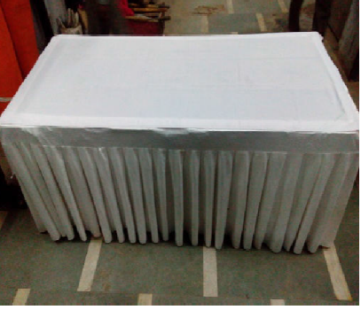
Table for Registration Area