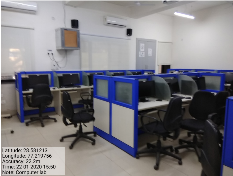
Latitude: 28.581213 Longitude: 77.219756 Accuracy: 22.2m Time: 22-01-2020 15:50 Note: Computer lab