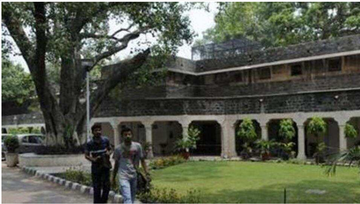
Ambedkar University campus.

Even as the country debates the feasibility of having a national language, an Ambedkar University initiative to improve English-speaking skill has turned out to become an interactive session promoting multilingualism and cultural exchange.