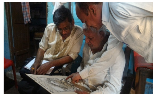
Image 1: Railway station platform, Pipariya (2017); Image 2: Local election rally, Pipariya (circa 1960); Image 3 and 4: Field interviews conducted by the local researchers, Pipariya (2017)

A publication based on this work called Aise Basi Pipariya is in process.